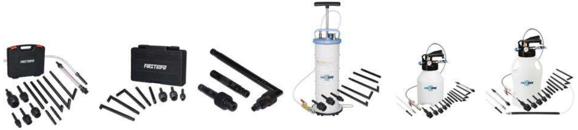
FIRSTINFO Transmission Automatic Fluid Oil Filling Filler Adapter 14Pcs FIRSTINFO Transmission Automatic Fluid Oil Filling Filler Adapter 8Pcs FIRSTINFO NEW Transmission Automatic Fluid Oil Filling Filler Adapter 3 pcs FIRSTINFO 6.5 Liter Manual ATF Refill System Dispenser FIRSTINFO 6 Liter TWO WAY Air/Pneumatic ATF Refill System Dispenser FIRSTINFO 10 Liter TWO WAY Air/Pneumatic ATF Refill System Dispenser